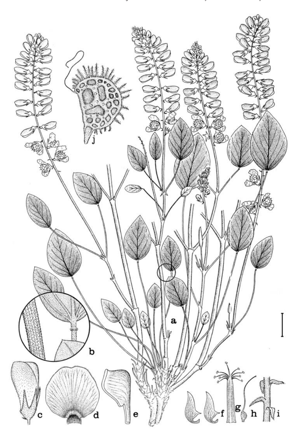
Fig. 1. Onobrychis aurea – a: habit; b: leaf (abaxial and adaxial views); c: flower; d: standard; e: keel; f: wings; g: androecium; h: pistil; i: bracts; j: fruit. – Scale bar for a = 2 cm, b-i = 0.5 cm, j = 0.3 cm.