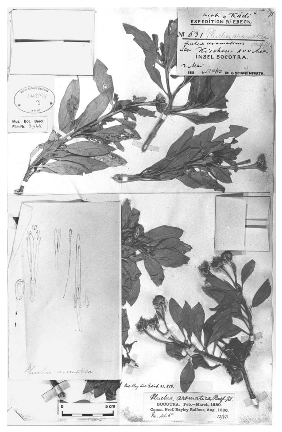
Fig. 1. Pulicaria aromatica – type sheet at Kew, with the lectotype Balfour 465 and the paralectotype Schweinfurth 631.