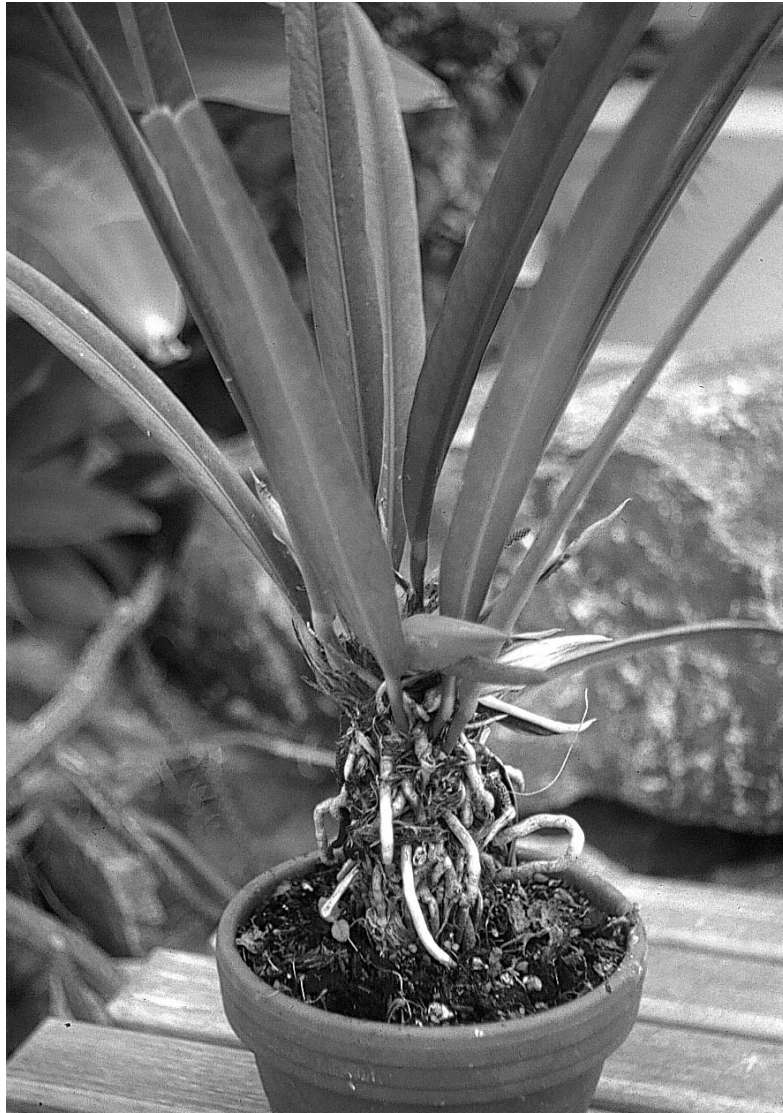
Fig. 1. Anthurium ensifolium – habit of a cultivated individual at the Munich Botanical Garden.

Stem thick, internodes short, 4.5-5.5 cm diam.; roots more or less dense, whitish to greenish, smooth; cataphylls lanceolate, 5-7 cm long, 0.6-0.8 cm wide, persisting as a mass of fibres. Leaves erect to slightly spreading; petiole 3.4-4.5 cm long, 0.3-0.5 cm diam., adaxially shallowly canaliculate with acute margins, abaxially rounded, the surface minutely white-punctate in fresh material, medium to dark glossy green; geniculum slightly thicker than the petiole, clear glossy green, 0.5-1 cm long; sheath 1.4-2 cm long; blade coriaceous, linear-elliptic to linear-oblong, acute to shortly acuminate at apex, obtuse to acute at base, 34-57 cm long, 2-4.5 cm wide, broadest at middle or slightly below, margins very weakly undulate in dry material; surface mat, medium to dark green, sometimes slightly glaucous or velvety, lower face mat, slightly paler, densely white-punctate in living plants; both faces drying mat, yellowish brown;