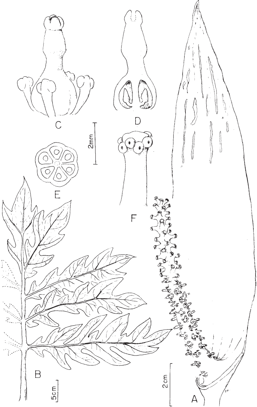
Fig. 3. Gorgonidium bulbostylum – A: spadix, spathe partially cut; B: leaf; C: female flower, side view; D: gynoeceum, longitudinal section; E: ovary, cross section; F: synandrium, side view. – Drawn from Liberian & al. 1857 by E. G. Gonçalves.