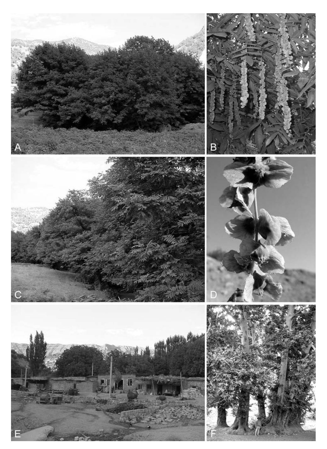
Fig. 3. Pterocarya fraxinifolia in the village of Derakhtchaman – A, C: dense population along the river with the Quercus brantii forest of the surrounding mountains in the background; B, D: fruiting spikes; E: view of the village; F: old Platanus orientalis tree with seven trunks just near P. fraxinifolia .