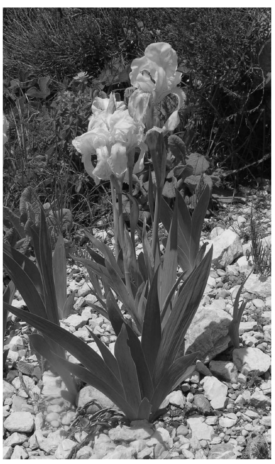
Fig.\ 2.\ \textit{Iris originii} - plants\ from\ the\ type\ collection\ cultivated\ at\ the\ Botanischer\ Garten\ M\"{u}nchen.