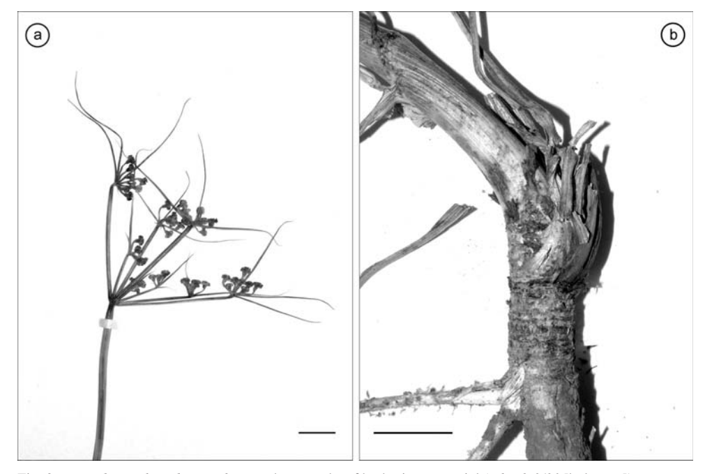
Fig. 3. Peucedanum longibracteolatum , photographs of herbarium material ( Ulrich 3/30 [holotype]) – a: compound umbel, flowering (note the extremely unequal rays and long extended bracteoles; b: rootstock with petiolar remains. – Scale bars: 0.5 cm (a), 1 cm (b).

1220 m, Steilhang, Exp. E, 25.10.2001, Ulrich 1/142 (MSB [fruiting synflorescences]). – C4 İÇEL: Silifke-Kırobası, etwa 22 km N Silifke, 980 m, eingezäuntes, bebuschtes Gelände, 21.10. 2002, Ulrich 2/61 (herb. Parolly [fruiting synflorescences]).