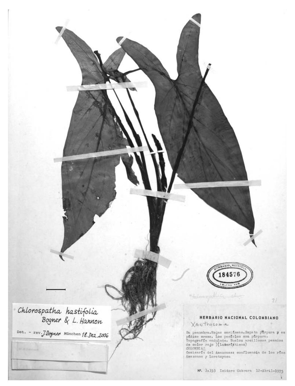
Fig. 3. Chlorospatha hastifolia – holotype at COL. – Scale bar = 2 cm; photograph by F. Höck.