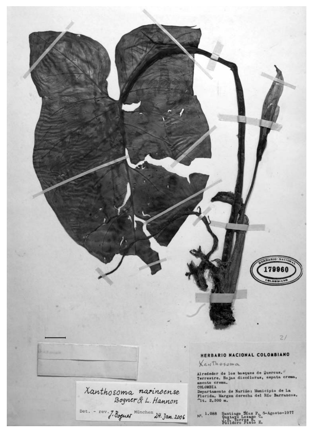
Fig. 1. Xanthosoma narinoense – holotype at COL. – Scale bar = 2 cm; photograph by F. Höck.