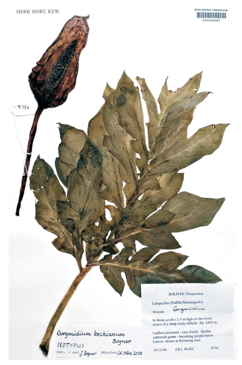
Fig. 2. Gorgonidium\ beckianum – isotype J.\ R.\ I.\ Wood\ 8796 at K.