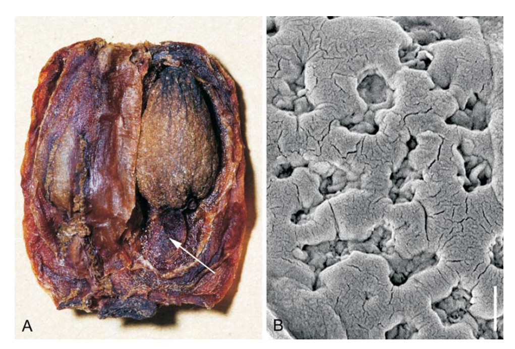
Fig. 3. Gorgonidium beckianum – A: berry, one locule opened to show the single ovoid, orthotropous seed with the funicle (arrow) still attached to the axile placenta; photograph from Kessler & al. 4823 (LPB) by G. Gerlach; B: exine of pollen grain, fissures in reticulum artificial by preparation; SEM micrograph by H. Halbritter.