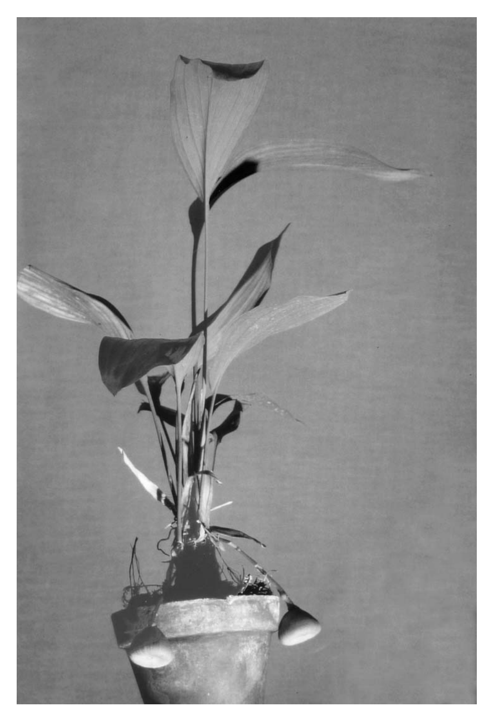
Fig. 2. Aspidistra locii – habitus of a flowering plant with two pendulous inflorescences of one flower each. – Plant cultivated in the Botanical Garden Munich; scale bar = 5 cm; photograph by G. Gerlach.