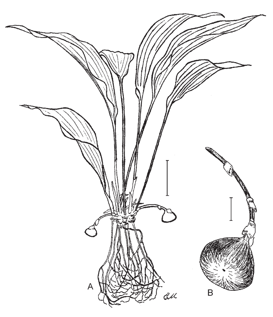
Fig. 1. Aspidistra locii – A: habit; B: inflorescence with the single flower. – Scale bars: A = 10 cm, B = 2 cm.