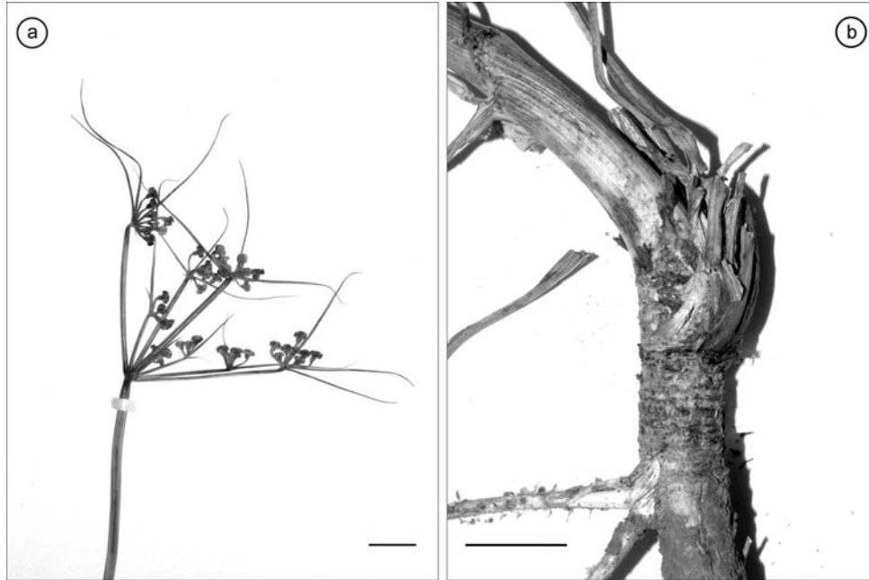
Fig. 3. Peucedanum longibracteolatum , photographs of herbarium material (Ulrich 3/30 [holotype]) – a: compound umbel, flowering (note the extremely unequal rays and long extended bracteoles; b: rootstock with petiolar remains. – Scale bars: 0.5 cm (a), 1 cm (b).

1220 m, Steilhang, Exp. E, 25.10.2001, Ulrich 1/142 (MSB [fruiting synflorescences]). – C4 İÇEL: Silifke-Kırobası, etwa 22 km N Silifke, 980 m, eingezäuntes, bebuschtes Gelände, 21.10.2002, Ulrich 2/61 (herb. Parolly [fruiting synflorescences]).