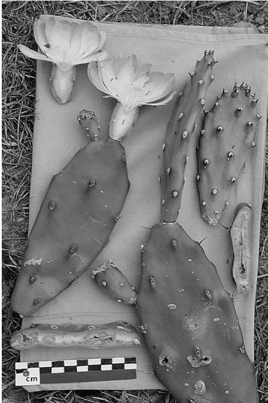
Fig. 2. Opuntia cardiosperma K. Schum. from Corrientes (Argentina), leg. Leuenberger & Arroyo-Leuenberger 4749, material for the herbarium prior to drying.