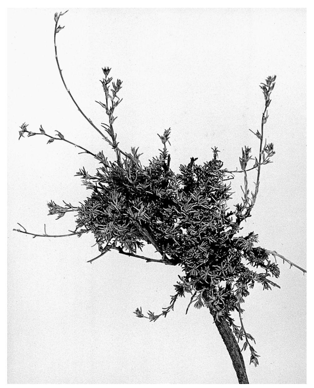
Fig. 1. Salsola canescens subsp. serpentinicola Freitag & E. Özhatay (holotype, ISTE 51123).

subsp. canescens still at hand from the Salsola account for "Flora iranica", the SW Anatolian plants proved to be sufficiently distinct to give them, at least, subspecific rank. We hesitated to describe them as a new species because all differences except the length of anther appendages could well be induced by the peculiar habitat conditions. This refers in particular to the subulate leaves of subsp. serpentinicola (Fig. 2D), because similar thick and stiff leaves have been seen in a few specimens of subsp. canescens from dry localities in N Iran.