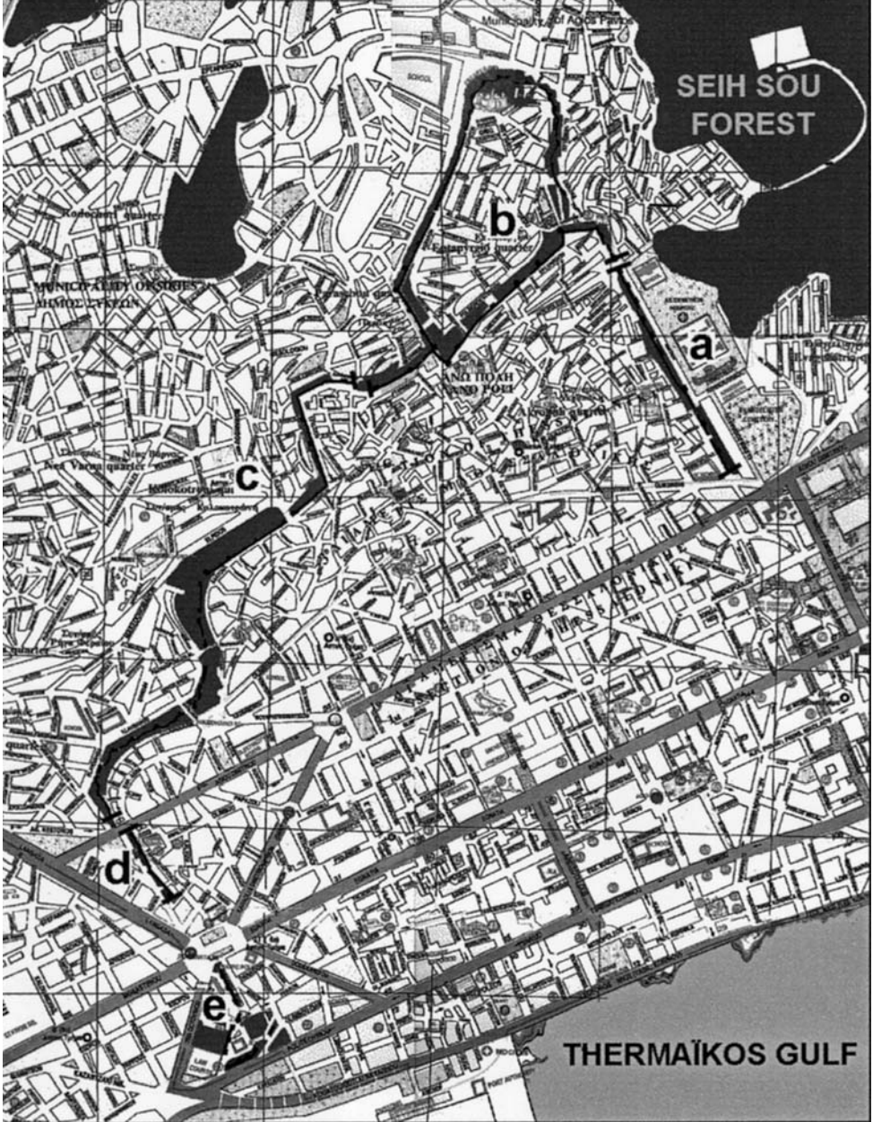
Fig. 1. The centre of Thessaloniki showing the location of the Byzantine Walls. The letters a-e indicate the different collection sites (scale 1: 20 800).