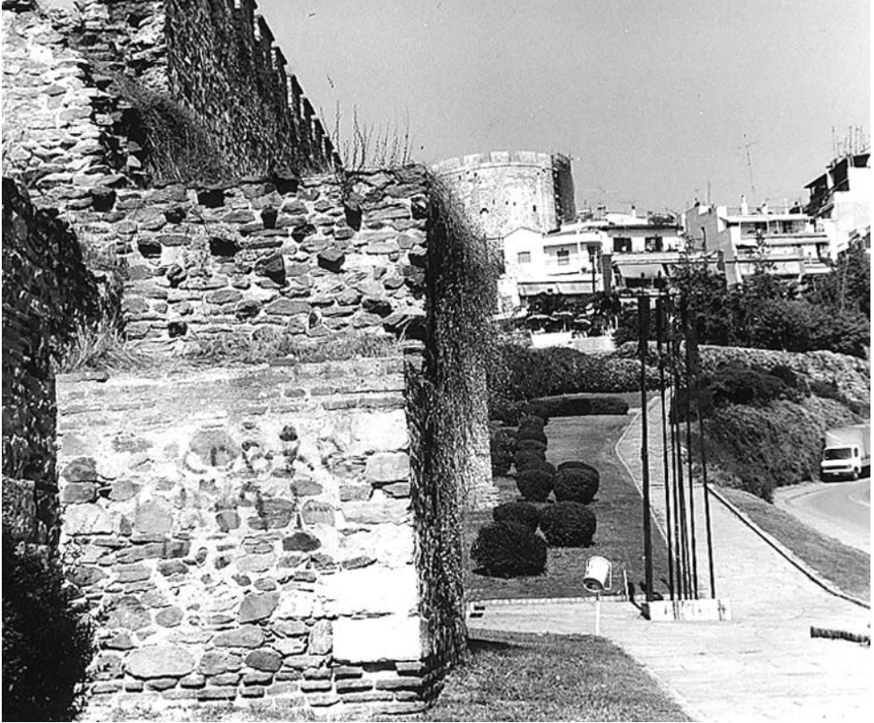
Fig. 2. The E part of the Byzantine Walls of Thessaloniki with Capparis spinosa subsp. spinosa growing on the side of the wall.

part. The greater intact part stands above Ag. Dimitriou Street. The height reaches up to 12 m, and the width ranges between 1.0 and 2.8 m. The style of the masonry varies according to the periods at which the different restorations were carried out. The greater part of the Walls, dating from the early Christian and the Byzantine periods, is constructed either of blocks of greenschist with interposed brick bands or of bricks decorated with rubble (Gounaris 1982). Mortar is mainly composed of lime and silicic materials in proportion of 1: 0.5-1: 2 (Papayanni pers. comm.). The Walls are surrounded by narrow open areas, up to 17 m from each side, which are either planted with a few species of ornamental trees and shrubs or are covered with spontaneous vegetation (Fig. 1-2).