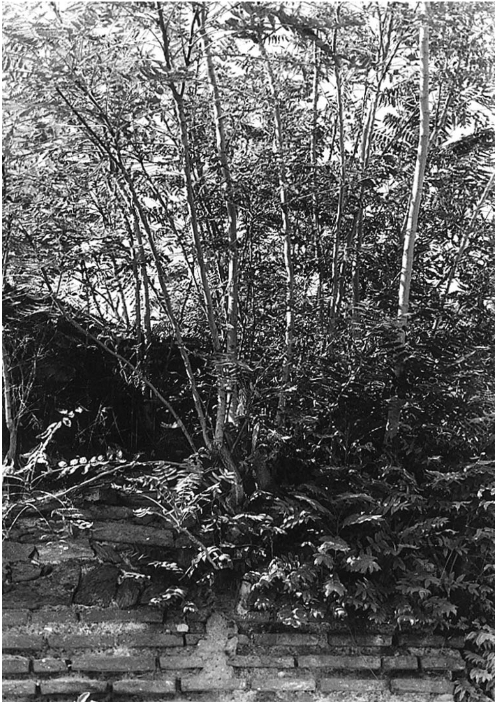
Fig. 4. Ailanthus altissima grows abundantly on the Byzantine Walls of Thessaloniki.