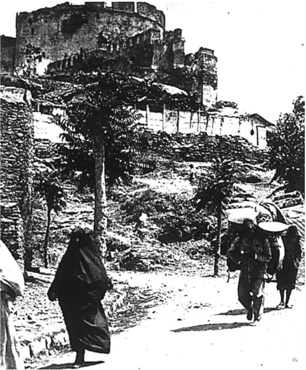
Fig. 5. The NE side of the Walls in 1913, when Ailanthus altissima was planted for ornament.

(sub-)Balkan element is represented only by 12 taxa, 5 of them occurring on the Walls, i.e. Sedum urvillei , Thymus sibthorpii , Verbascum leucophyllum , V. undulatum and Silene flavescens subsp. thessalonica . The last taxon, originally described as S. thessalonica Boiss. & Heldr. because of the proximity of its locus classicus to the city (“In rupibus montis Korthiati pr. Thessalonicam alt. 1500’ leg. Heldreich), is mainly found in NE Greece and extends to F.Y.R. Makedonija and Bulgaria just beyond the Greek borders (Greuter 1997).