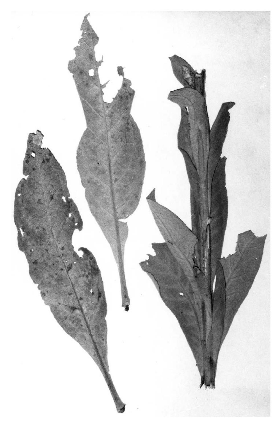
Fig. 2. Verbascum \times sibyllinum – holotype, middle part of the plant and two basal leaves.

Sutorý: Verbascum × sibyllinum, a new nothospecies from Italy