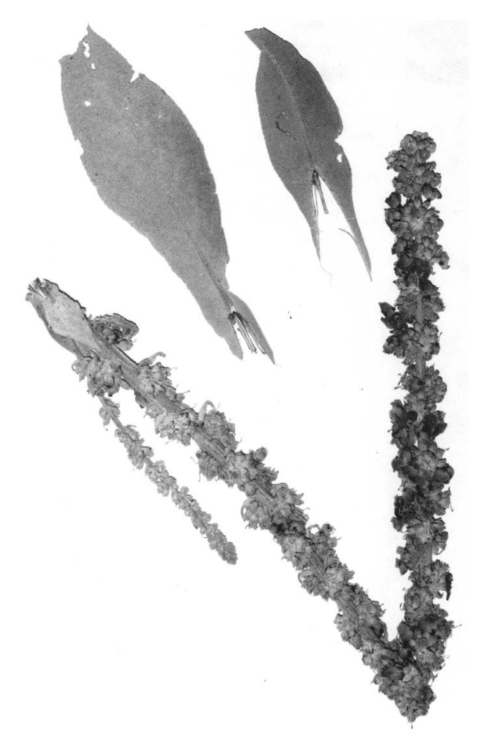
Fig. 1. Verbascum × sibyllinum , holotype, upper part of the plant.