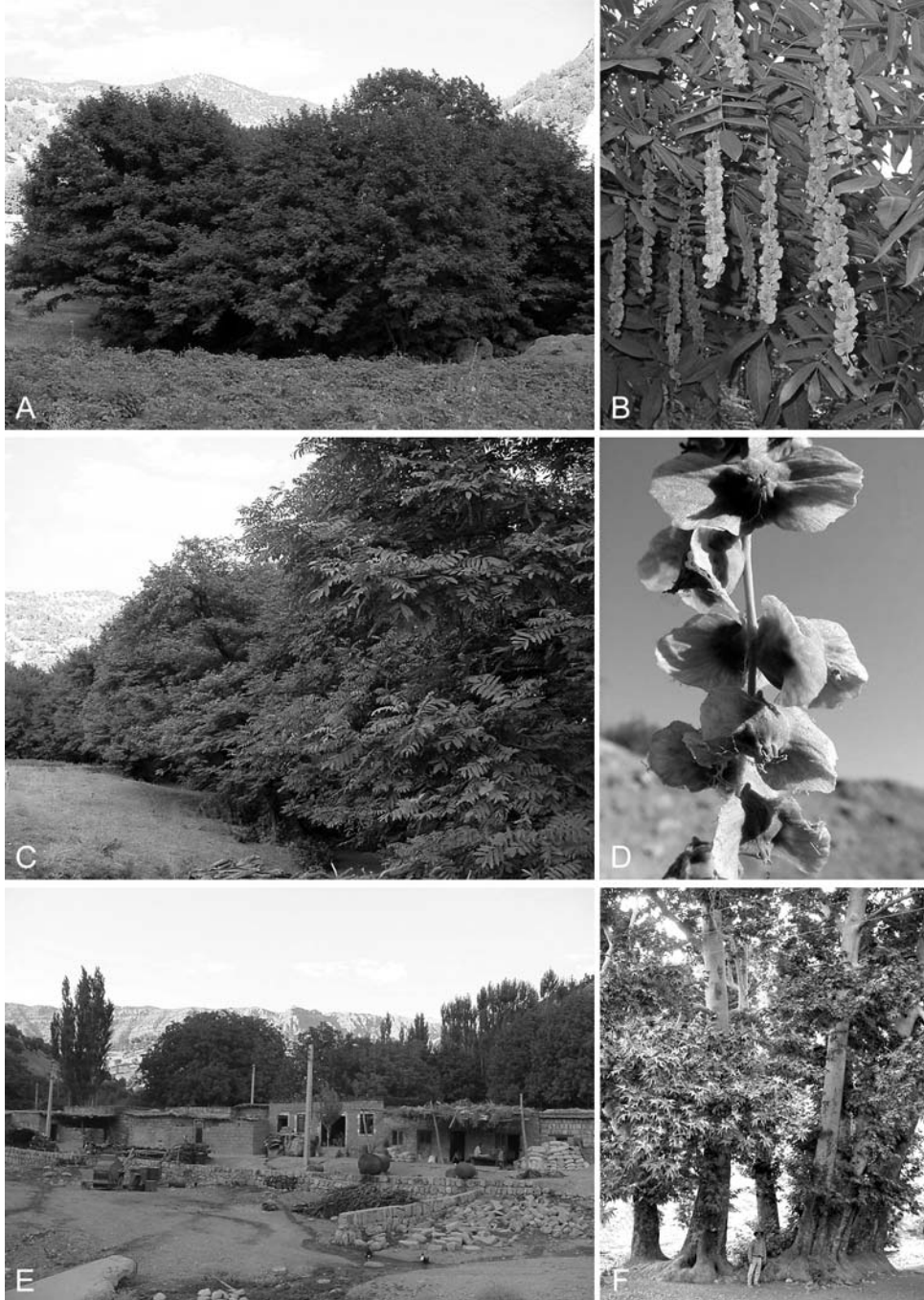
Fig. 3. Pterocarya fraxinifolia in the village of Derakhtchaman – A, C: dense population along the river with the Quercus brantii forest of the surrounding mountains in the background; B, D: fruiting spikes; E: view of the village; F: old Platanus orientalis tree with seven trunks just near P. fraxinifolia .