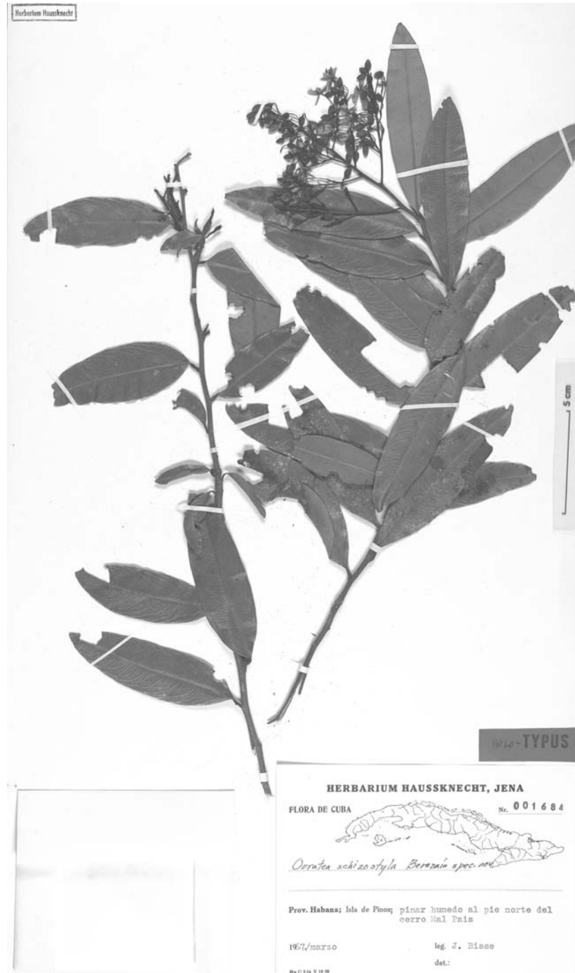
Fig. 1. Ouratea schizostyla , holotype specimen.