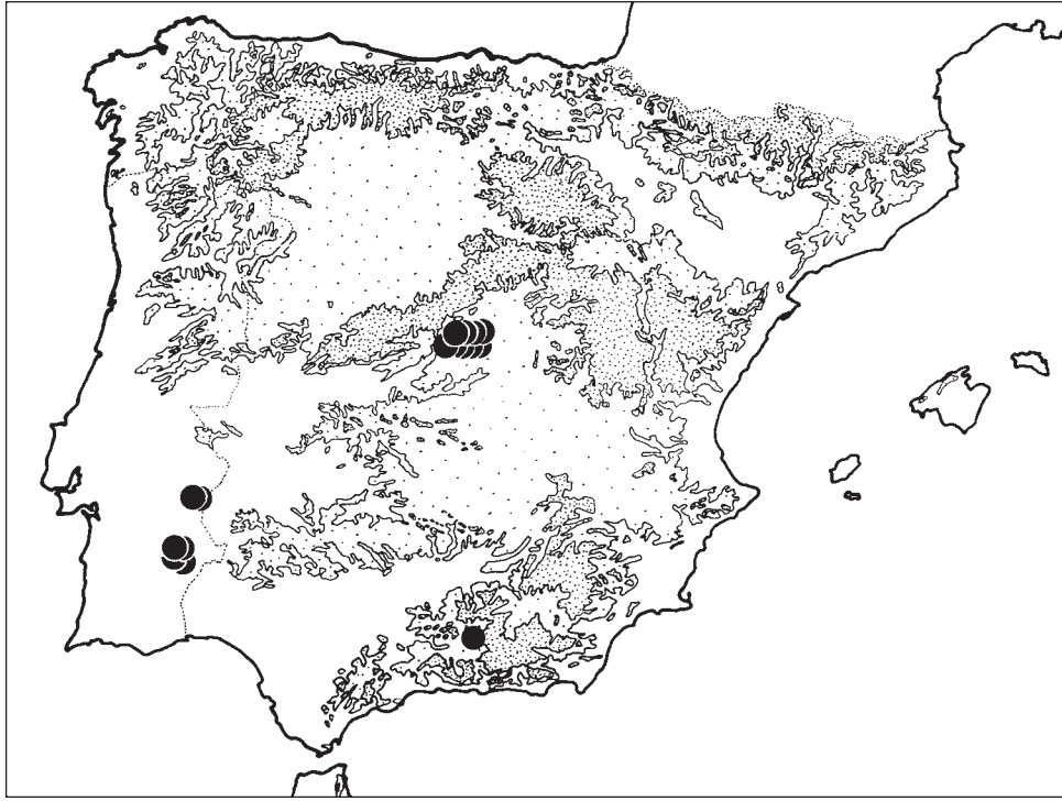
Fig. 3. Known European distribution of Arcyna tournefortii , based on available specimens.

them only in Arctium L., Cynara spp. and Ptilostemon stellatus (L.) Greuter (Greuter, l.c.: 29-30). They appear to be reduced forms of the whip-like hairs that are common throughout the Asteraceae (Solereder, Syst. Anat. Dicotyledons 1. 1908).