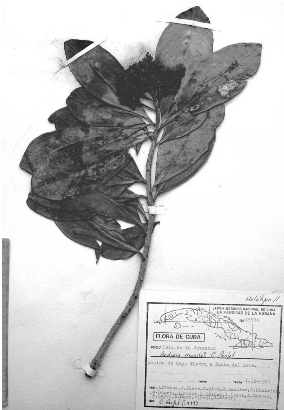
Fig. 1. Ardisia manitzii Panfet, holotype specimen.