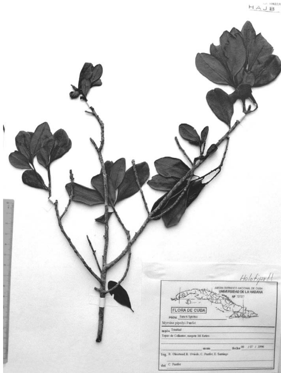
Fig. 3. Myrsine pipolyi Panfet, holotype specimen.