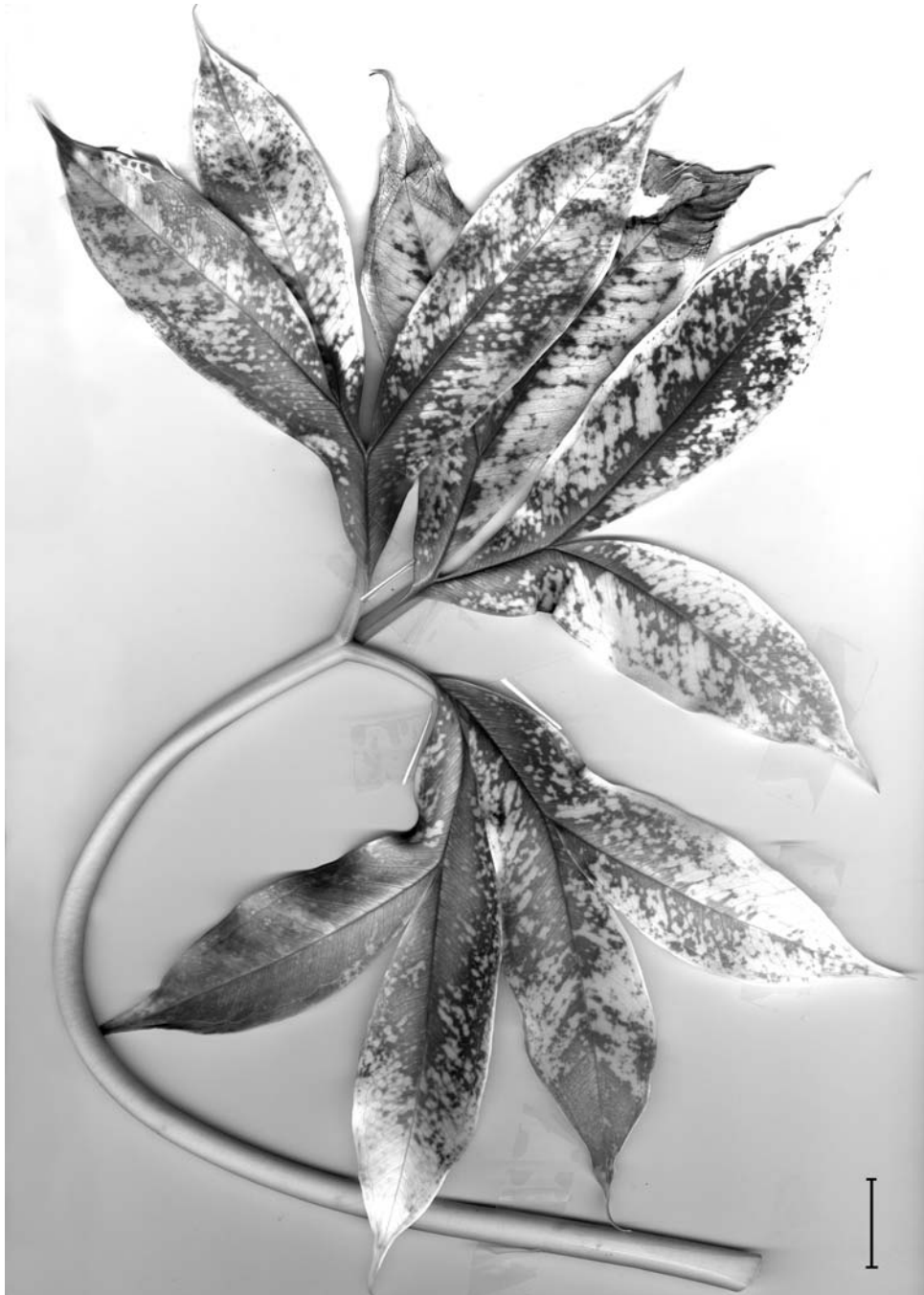
Fig. 2. Amorphophallus mangelsdorffii – Leaf from a cultivated plant originating from the locus typicus. – Scale bar = 2 cm; photograph by R. Mangelsdorff.