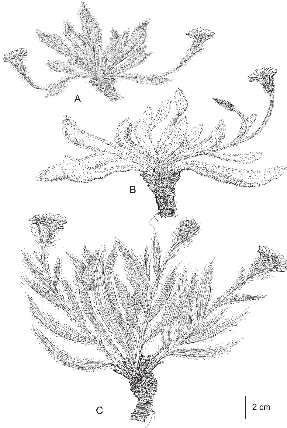
Fig. 2. Scorzonera karabelensis (A), S. ulrichii (B), S. pisidica (C) . – A after R. Ulrich 3/7b, B after R. Ulrich 2/12, C after R. Ulrich 2/22; drawings by Alexander Ehler (BGBM).