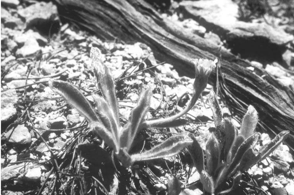
Fig. 1. Scorzonera karabelensis – photograph, from the type locality, by R. Ulrich, 2003.