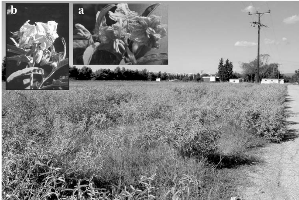
Fig. 2. Fallow fields in the collection site B5i (fringe urban area of the city of Thessaloniki) invaded by Solanum elaeagnifolium , with violet-flowered (a) and white-flowered (b) individuals growing together.

the opinion of Richards (pers. com.). In every other case the relevant source is provided specifically.