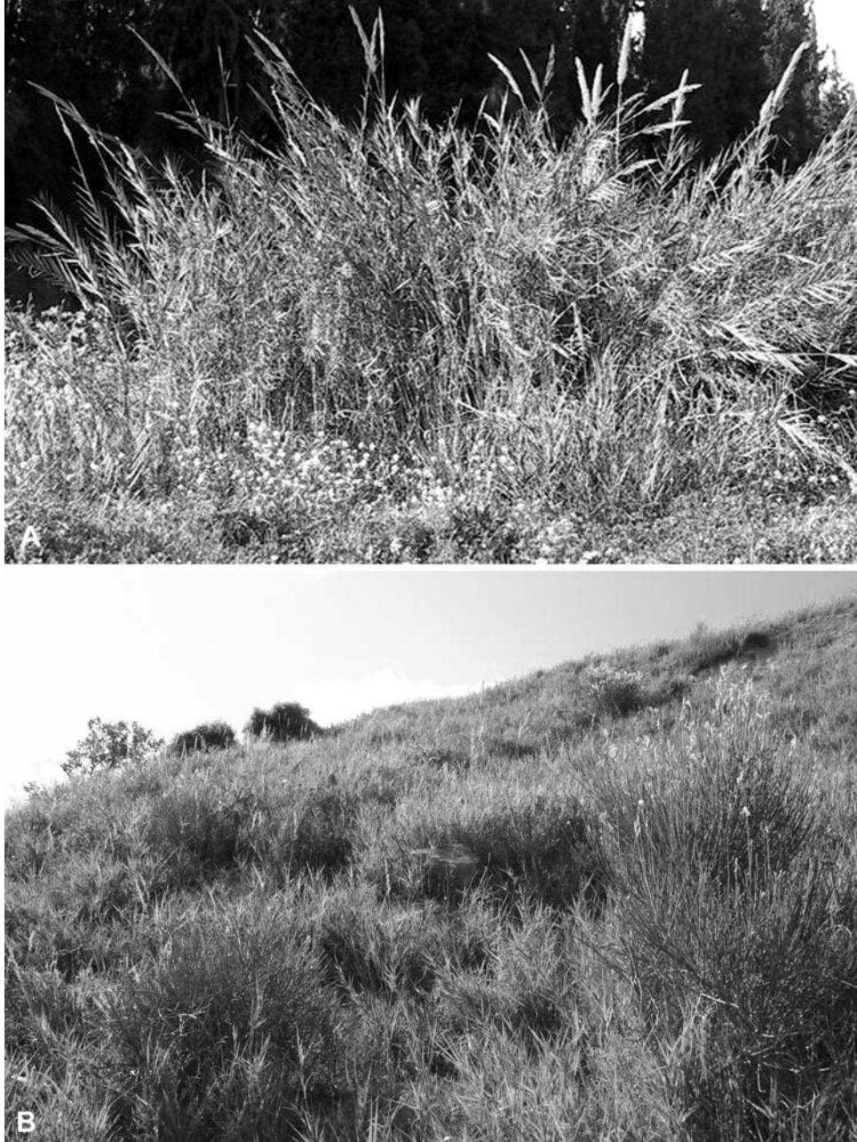
Fig. 2. A: Arundo mediterranea , isolated tufts of “bunch-reed” with obliquely erect peripheral culms at the type locality in Israel. – B: A. collina forming a monospecific grassland, with a few Spartium junceum shrubs, on clay slopes at the catchment area of Biferno river, S Italy.