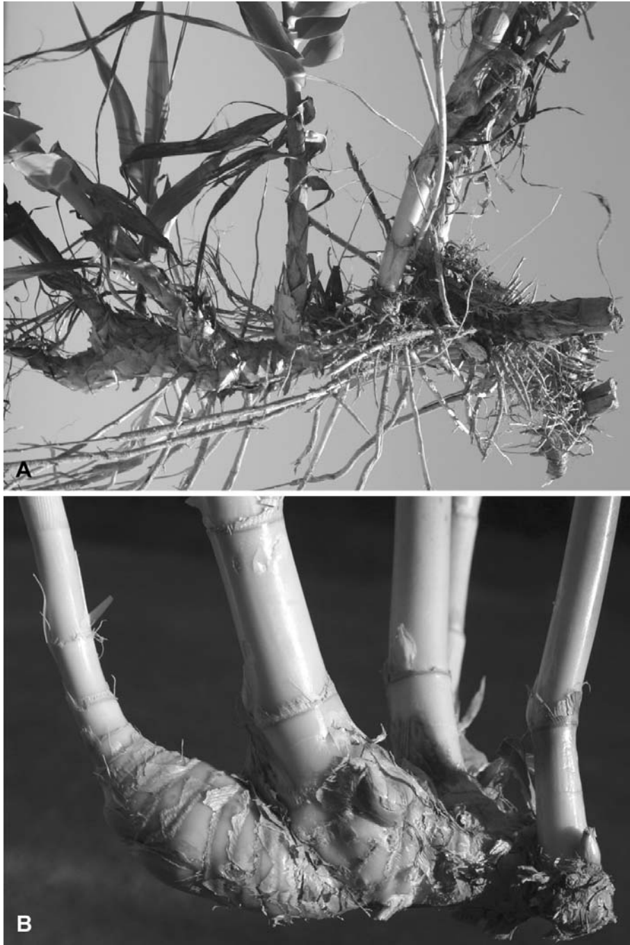
Fig. 3. A: Arundo donax rhizome with spaced orthotropic culms. – B: A. mediterranea , each culm has a 8-10 cm long pachyrrhizome section, rich in buds, which may function as a corm; each of the three left culms emerged obliquely from the base of the older culm.