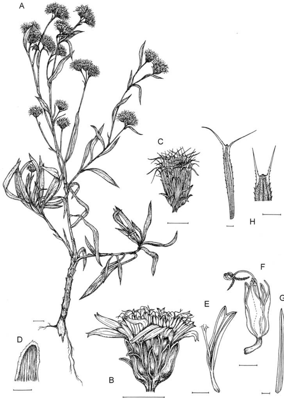
Fig. 1. Isostigma herzogii – A: habit; B: capitulum in flower; C: capitulum at fruiting; D: apex of an inner phyllary; E: marginal flower; F: disc flower; G: palea; H: cypselae. – A, C, F-H after Krapovickas, Mroginski & Fernández 19317 (CTES), B-D after Herzog 617 (G), E after Caballero Mármori 658 (CTES); scale bars: A = 1 cm, B-C = 5 mm, D-H = 1 mm.