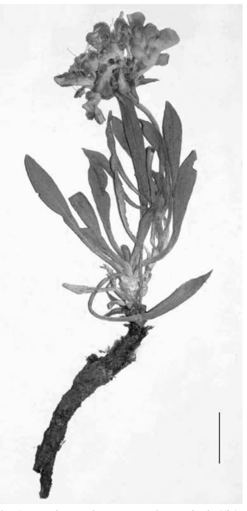
Fig. 1. Lomelosia solymica – specimen Ulrich 4/24a (herb. Parolly). – Scale bar = 1 cm.

Compact, pulvinate chamaephyte, forming flat cushions to 40 cm in diam. and 3-5 cm height, with numerous flowering and sterile rosettes. Rootstock branched, fairly stout, 0.5-1 cm in diam., densely clothed by the imbricately arranged petiolar remains of the previous years' leaves. Stems short, including the peduncle (10-)15-35(-45) mm long, 1-1.5 mm in diam. at the base, ascending to erect, simple, somewhat flattened and indistinctly 2-winged at the base, very densely white-pubescent with short (c. 0.1 mm) retrorse hairs (sometimes in addition with c. 0.02-0.05 mm long hairs). Leaves vividly green, (sub)coriaceous, most of them in the basal rosette, entire, with a distinct, occasionally somewhat undulate, 0.1-0.2 mm wide hyaline margin, mostly glabrous, exceptionally with scattered marginal setae, midvein whitish (green), very prominent especially on the lower surface; leaf bases flattened and expanded to form paler leaf sheaths, c. 2-4 mm long. Rosette leaves