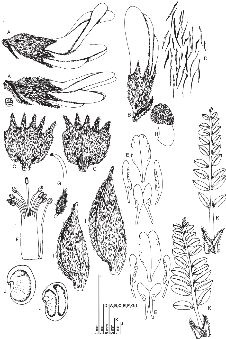
Fig. 4. Astragalus sirinicus – A: flowers; B: flower bud; C: open calyces; D: calyx indumentum; E: petals; F: stamens; G: pistil; H: stigma; I: legumes; J: seeds; K: leaves. – Drawn after material from Mt Sirino (locus classicus).