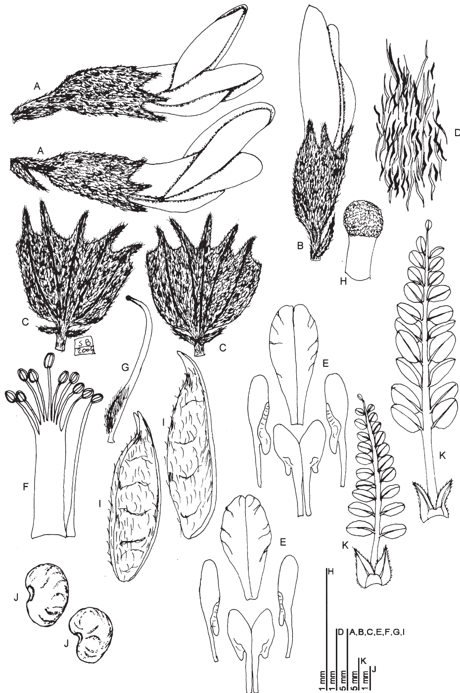
Fig. 1. Astragalus genargenteus – A: flowers; B: flower bud; C: opened calyces; D: calyx indumentum; E: petals; F: stamens; G: pistil; H: stigma; I: legumes; J: seeds; K: leaves. – Drawn after material from Bruncu Spina in Mt Gennargentu (locus classicus).