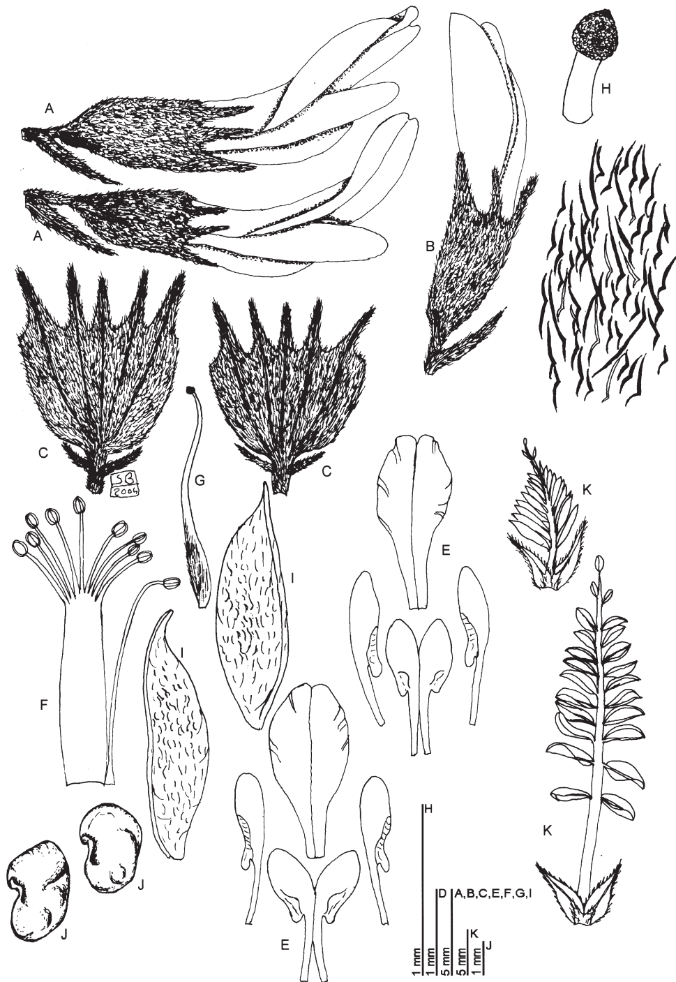
Fig. 3. Astragalus greuteri – A: flowers; B: flower bud; C: open calyces; D: calyx indumentum; E: petals; F: stamens; G: pistil; H: stigma; I: legumes; J: seeds; K: leaves. – Drawn after material from Col di Bavella (locus classicus).