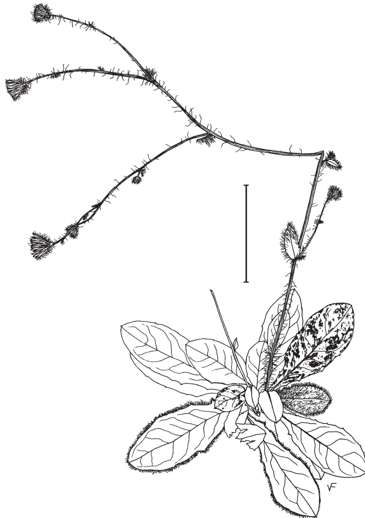
Fig. 1. Hieracium greuteri . – Scale bar = 5 cm; spots and indumentum of the basal leaves exemplarily shown; drawn after the holotype by Felicitas Velten.