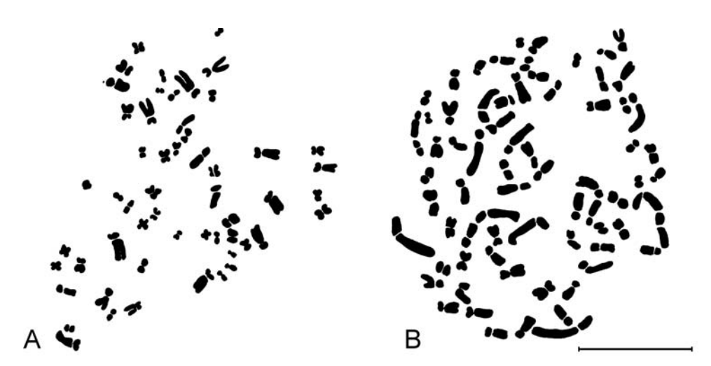
Fig. 2. Mitotic metaphase plates of Limonium narbonense – A: 2n = 6x = 54, material from Magnisia, Chrisi Akti Panagias ( Georgakopoulou & Manousou 214a ); B: 2n = 8x = 72 ( Georgakopoulos & Manousou 214 ). – Scale bar = 10 \, \mu m .

The populations of Limonium narbonense were found to be hexaploid with 2n = 6x = 54 and octoploid with 2n = 8x = 72 (Table 1, Fig. 2). The chromosome number 2n = 6x = 54 has also been counted for the closely related Greek endemic L. brevipetiolatum (Artelari & Erben 1986) as well as for the European relative L. humile Mill. (Erben 1979). L. narbonense was known so far as tetraploid with 2n = 36 from Greece (Artelari 1992) and as diploid with 2n = 18 and as tetraploid from the wider Mediterranean region (Baker 1953c, Erben 1978, 1979, 1993, Brullo & Pavone 1981, Palacios & al. 2000). Both hexaploid and octaploid karyotypes lack the 'marker' chromosomes (Fig. 2) and this is also the case in the karyotype with 2n = 36 (Erben 1978, Artelari 1992). As is shown in Table 1, at the locality "Chrisi Akti Panagias" both chromosome numbers 2n = 54 and 72 were counted. In this place, individuals with 2n = 72 were found in the exterior side of the bay, exposed to wind and waves and it seems that their high ploidy level is a response to the extreme ecological conditions. These plants are more robust and advanced in flowering than those with 2n = 54, but the detailed study of their morphological characters did not show any other significant difference. The octaploid number 2n = 72 is the highest reported so far for the genus Limonium .