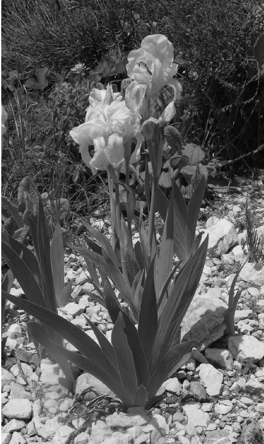
Fig. 2. Iris orjenii – plants from the type collection cultivated at the Botanischer Garten München.