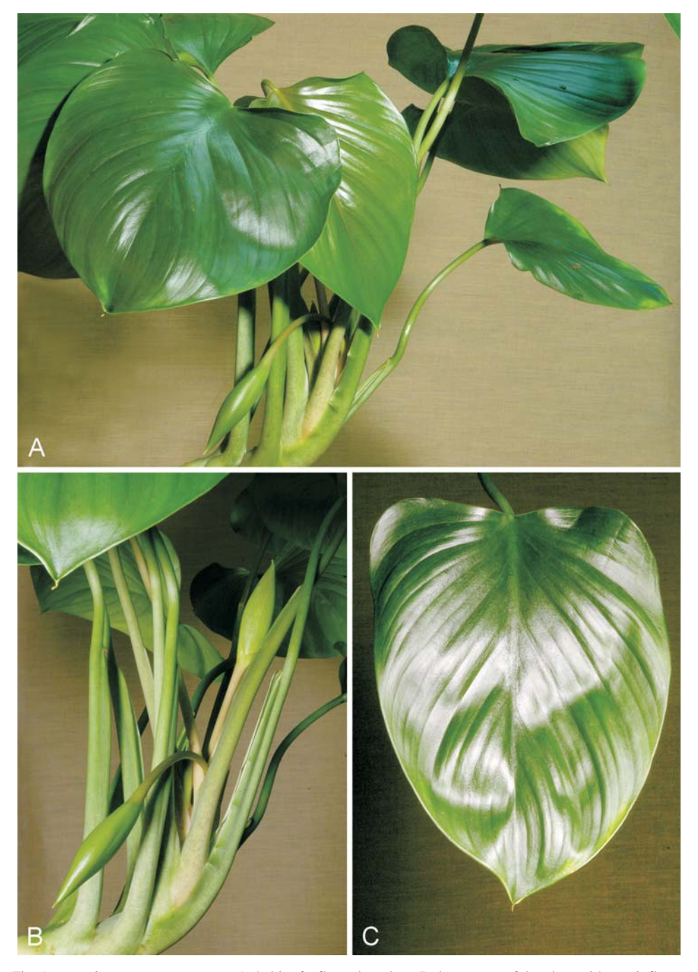
Fig. 1. Homalomena vietnamensis – A: habit of a flowering plant; B: lower part of the plant with two inflorescences, the younger one still erect and the other turned downwards after anthesis; C: single leaf, note the truncate base, the mucronate apex and the glossy upper side of the blade. – Plant cultivated at the Botanic Garden Munich from the same wild source as the holotype.